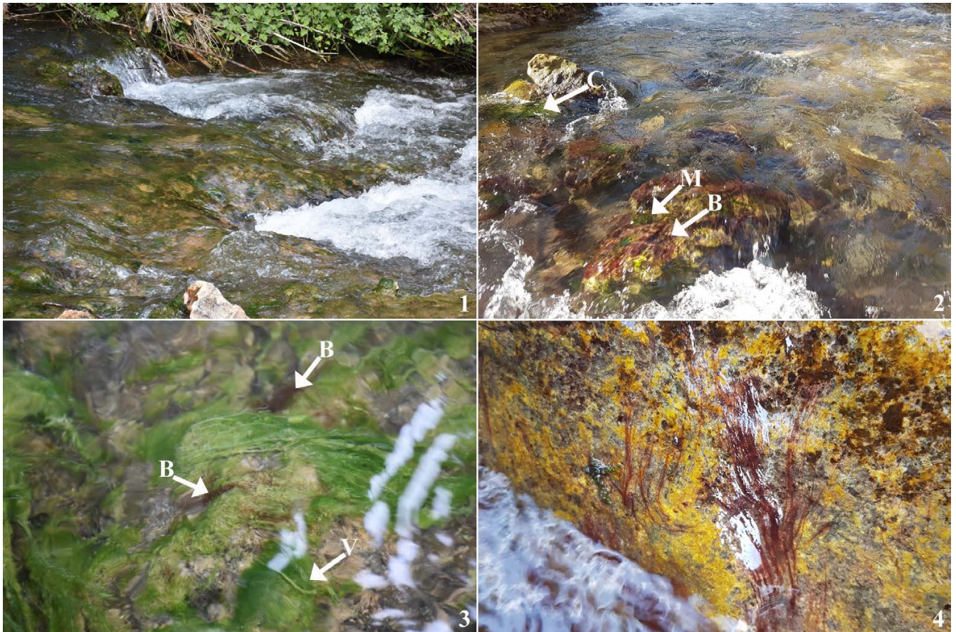
Fig. 2. 1 - Macroalgal associations in the Raška River; 2 - Bangia atropurpurea ( \rightarrow B) growing among the filaments of Cladophora glomerata ( \rightarrow C) and Microspora amoena ( \rightarrow M); 3 - Bangia atropurpurea ( \rightarrow B) growing among the filaments of Vaucheria sp. ( \rightarrow V); 4 - habitus of Bangia atropurpurea