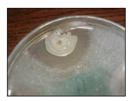
Fig. 1. Antagonism of isolate Ab<sub>9</sub> isolated from melon leaf

Apart from the strains of soil bacteria isolated as described above, one isolate was obtained by isolation from the melon leaf. When isolating the causal agent of the spots that appeared on the melon leaves, colonies of bacteria with signs of antagonistic action on fungal colonies that developed next to them (Fig. 1) developed as a by-product and were, therefore, included in this study. After obtaining individual colonies, it was kept in the same way as the above-mentioned bacteria.