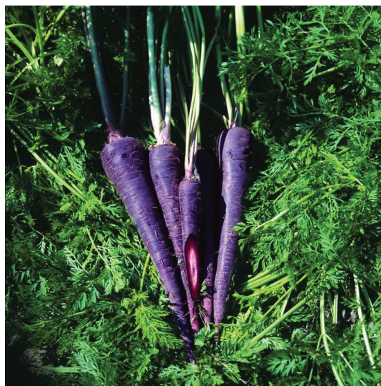
Figure 1. Daucus carrota cv. 'Vizija'

Stimulation of carrot seed germination by Pseudomonas strains and difference between seed germination induced by each strain and the control sample is shown in Figure 2 and Table 1. P. chlororaphis Q16 induced a statistically significant increment in seed germination for all applied fractions and in both incubation periods. The weakest seed germination potential was observed in Pseudomonas sp. Ek1, showing the same or lower values than control samples when culture or CFSa (II) were applied.